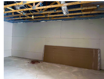
construction for new children's area