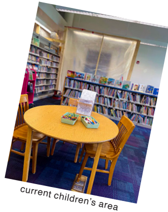
current children's area